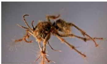
Fungus growing on host ant

Why is it called a “zombie fungus”? The Newsweek post explains that “Fungi in this group infects ants and other insects and often control their behavior to maximize their potential to spread—before ultimately killing the animal.